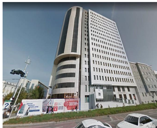
Block 'B' UB GRAND HOTEL