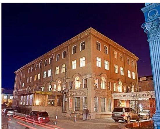
Block 'A' PUMA IMPERIAL HOTEL

The Organizing Committee will reserve rooms for Workshop participants on their request and also you will contact directly with the PUMA IMPERIAL HOTEL . Block 'A' is old one 'B' is new one and just now named UB GRAND HOTEL . Prices are similar.